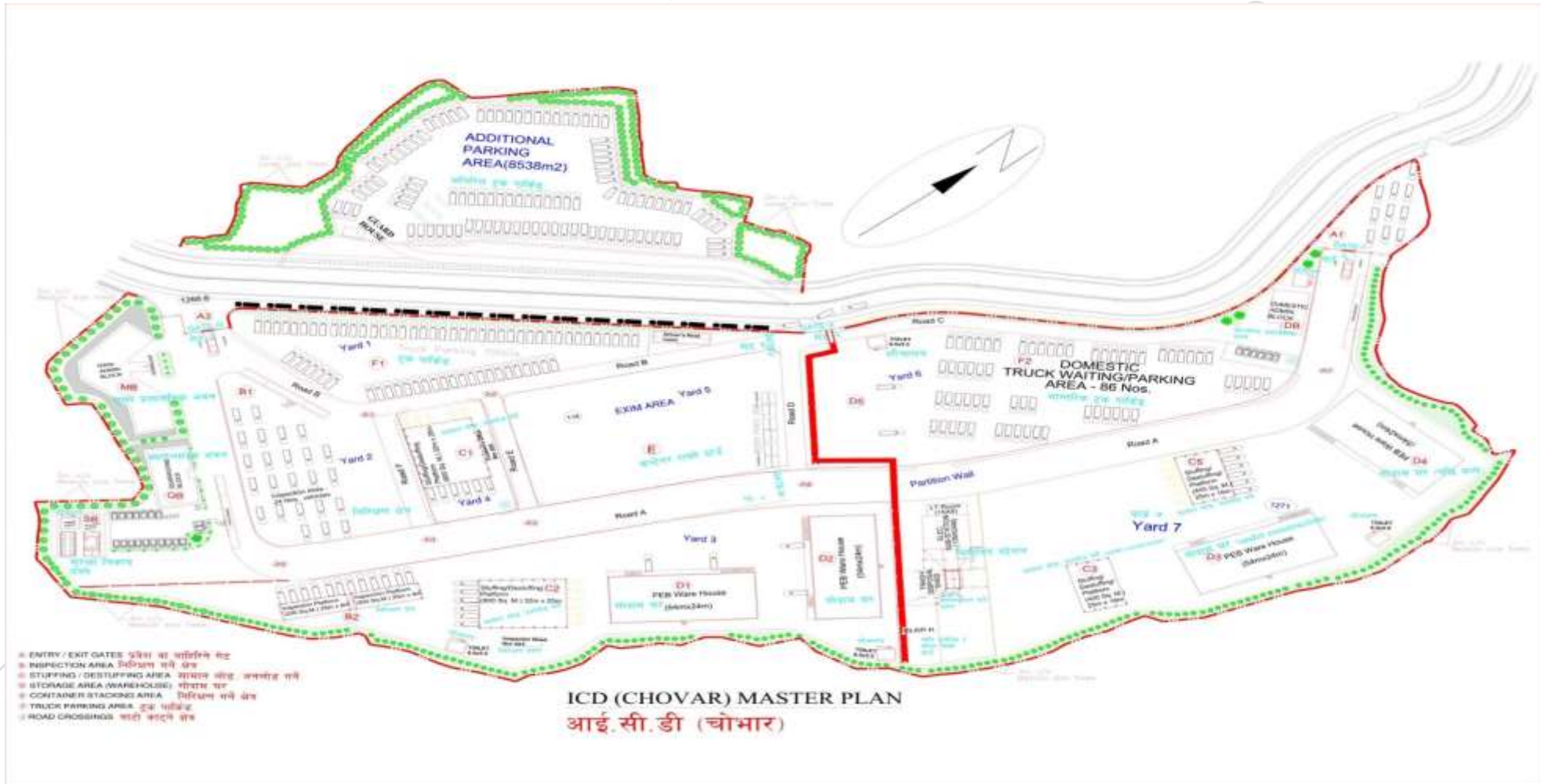
General Layout of Chobhar ICD (for the purpose of TECH-9)